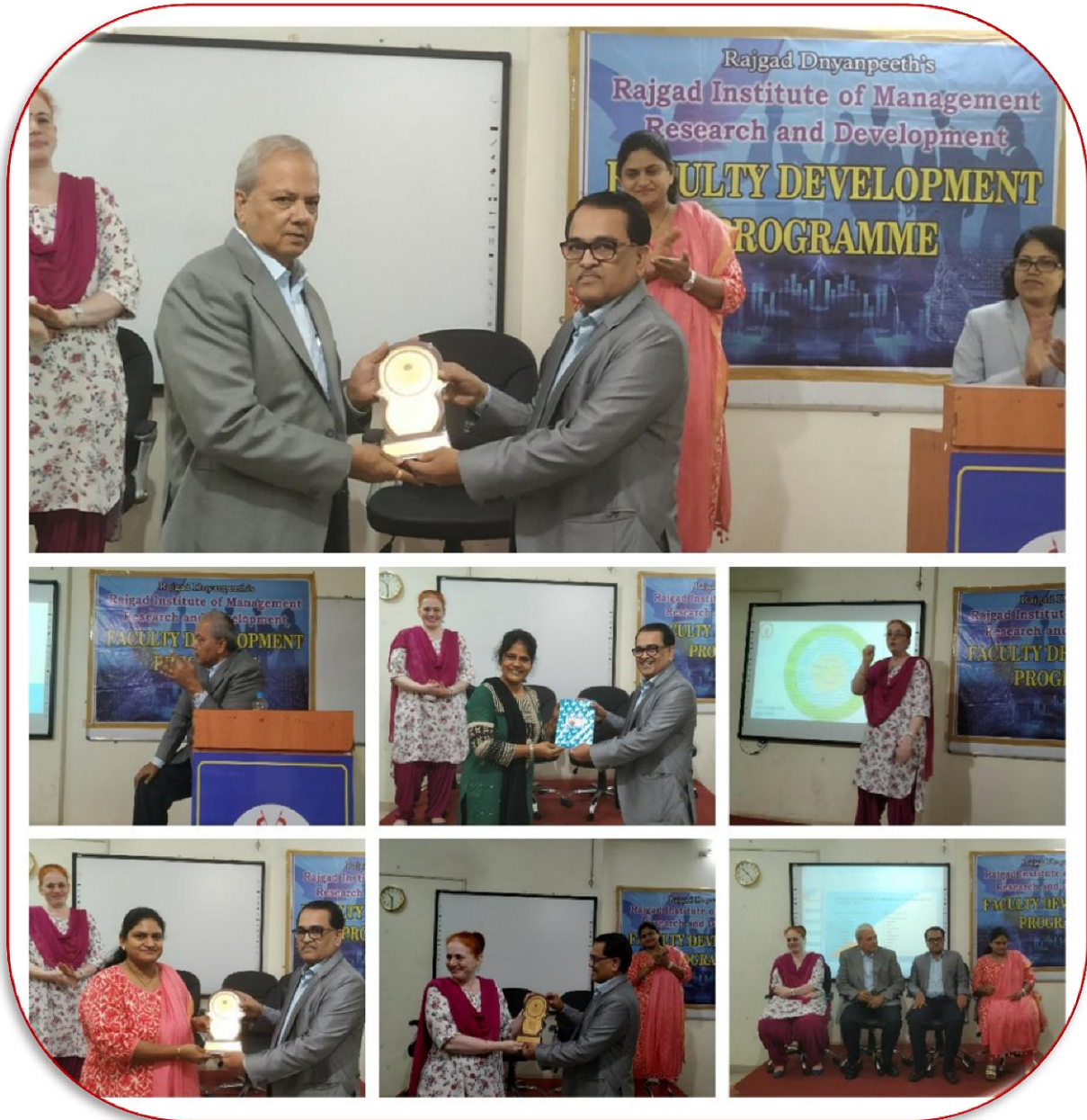
Glimpses of the FDP

Approved by AICTE, Recognized by DTE (Govt. of Maharashtra), Affiliated to Savitribai Phule Pune University