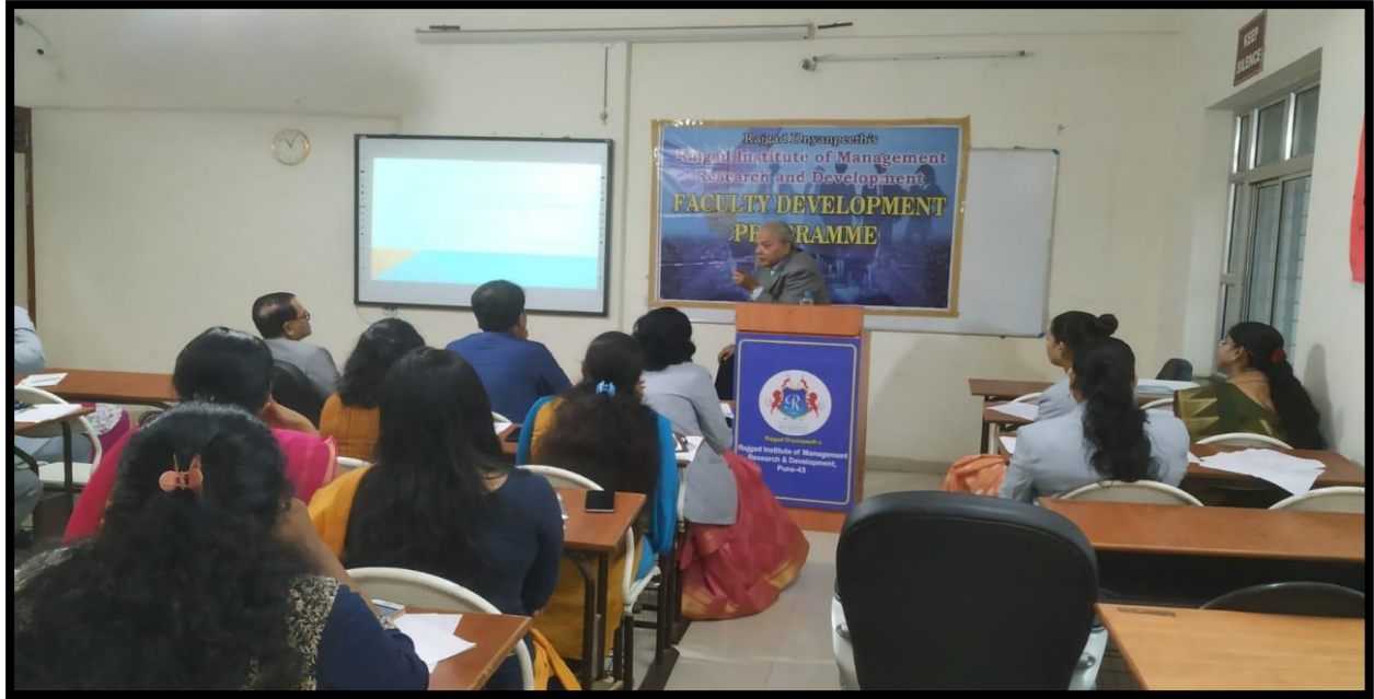
Faculty Participants for FDP

Approved by AICTE, Recognized by DTE (Govt. of Maharashtra), Affiliated to Savitribai Phule Pune University