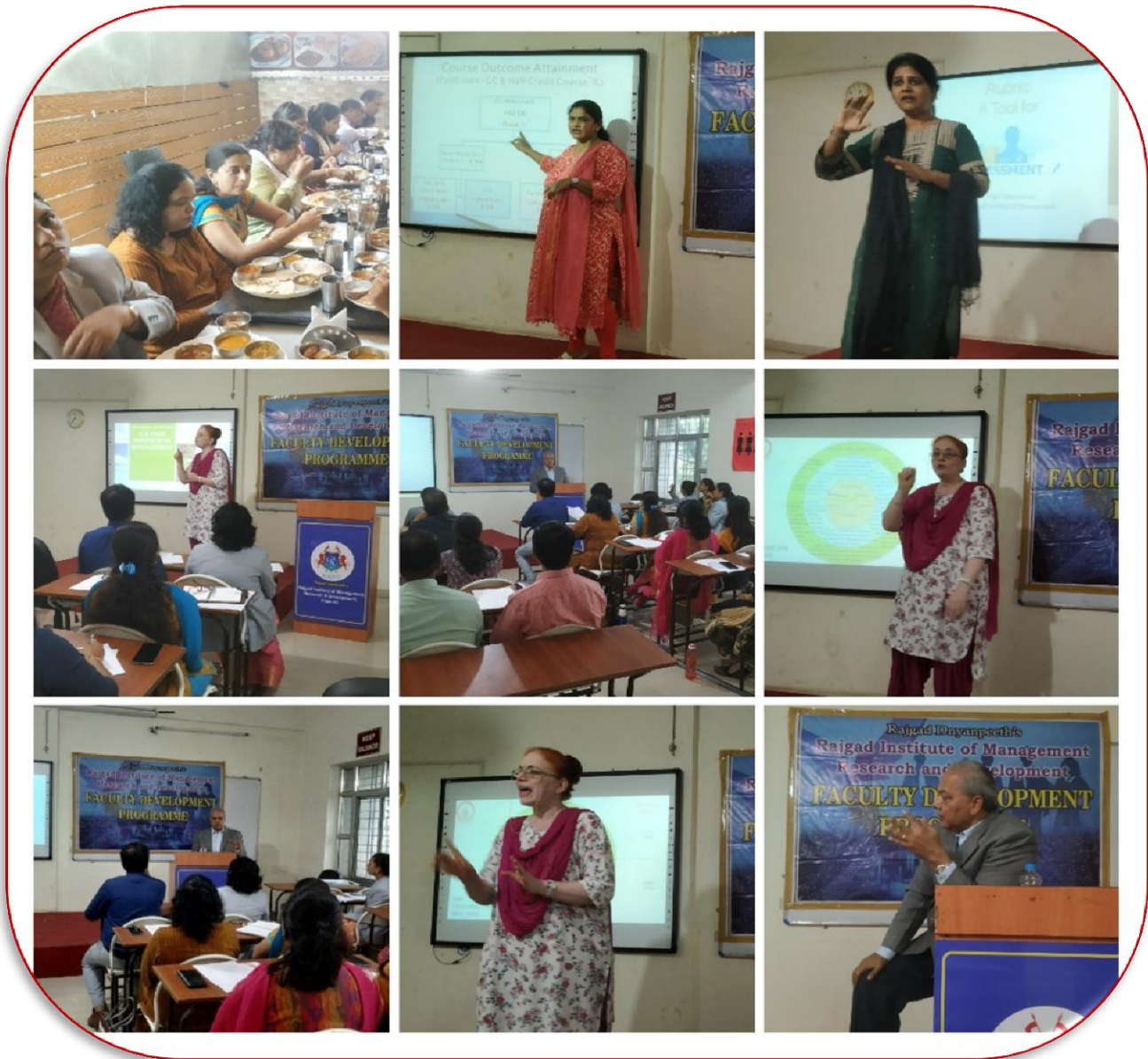
Glimpses of the FDP

Approved by AICTE, Recognized by DTE (Govt. of Maharashtra), Affiliated to Savitribai Phule Pune University